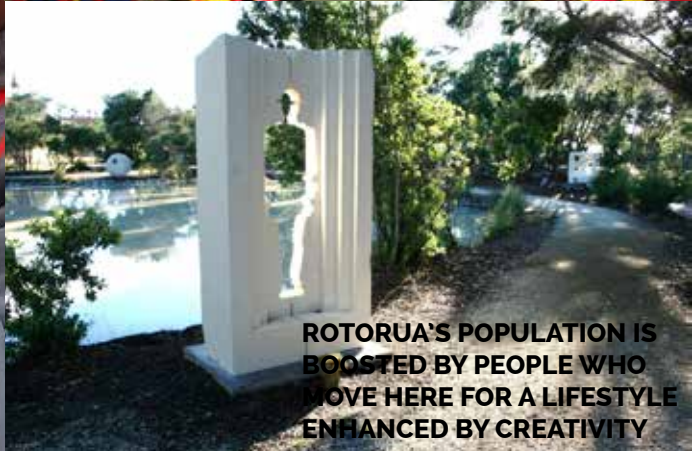
ROTORUA'S POPULATION IS BOOSTED BY PEOPLE WHO MOVE HERE FOR A LIFESTYLE ENHANCED BY CREATIVITY