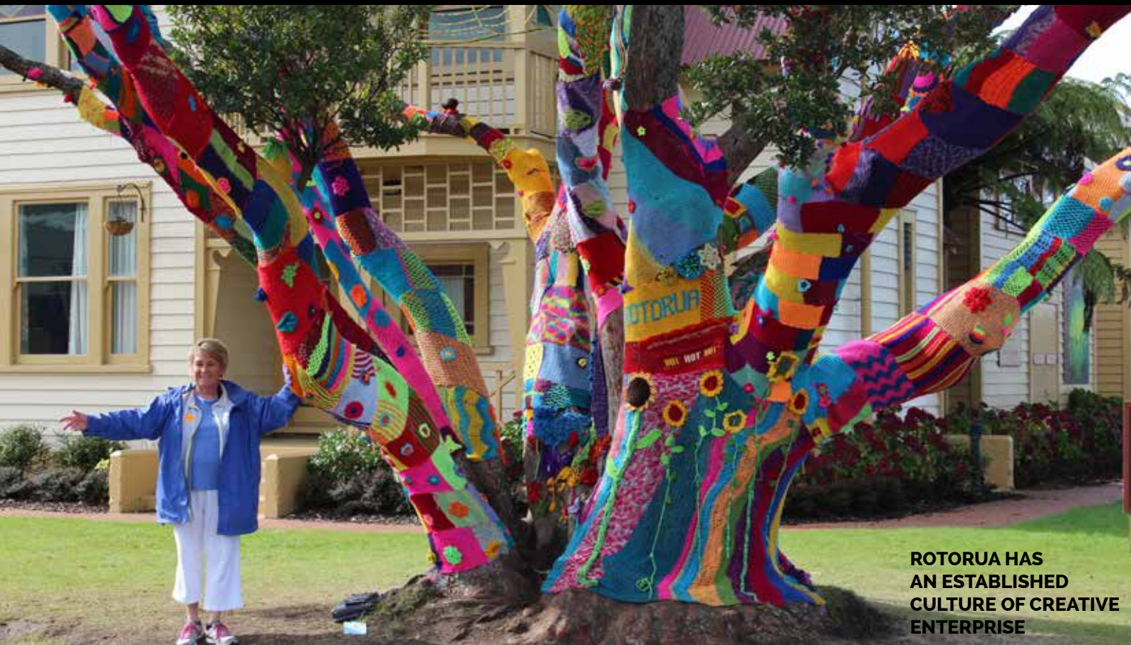
ROTORUA HAS AN ESTABLISHED CULTURE OF CREATIVE ENTERPRISE