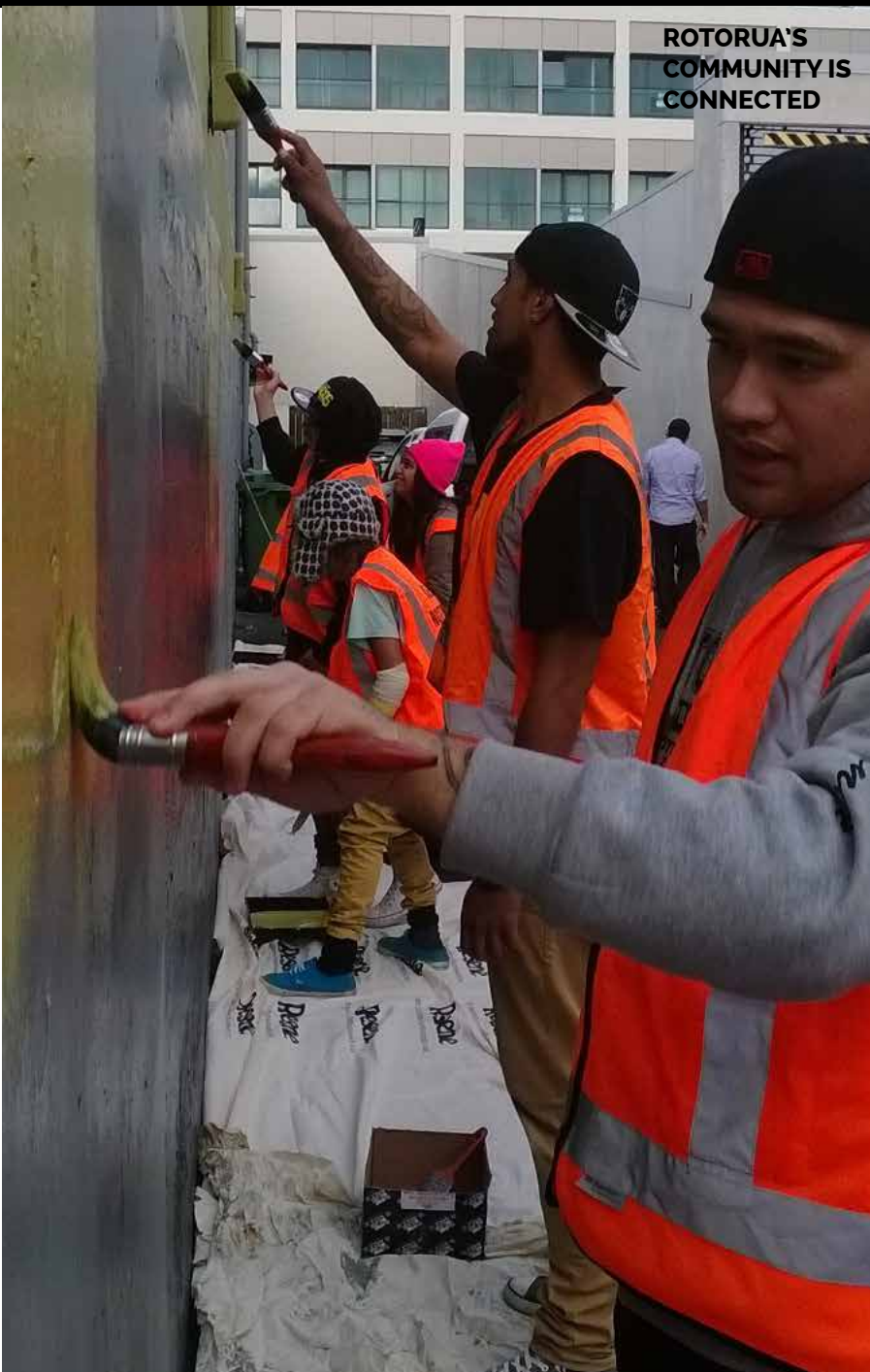
ROTORUA'S COMMUNITY IS CONNECTED