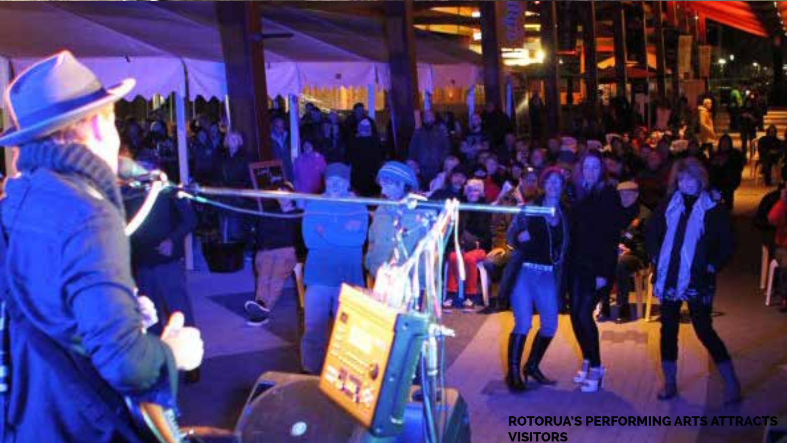
ROTORUA'S PERFORMING ARTS ATTRACTS VISITORS