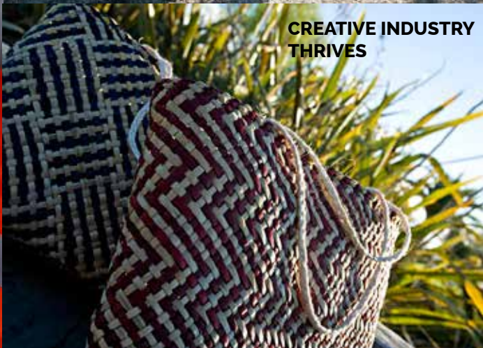
CREATIVE INDUSTRY THRIVES