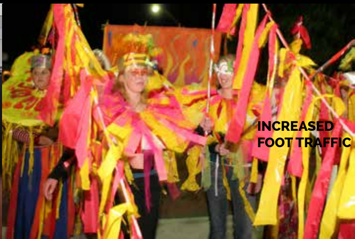
INCREASED FOOT TRAFFIC