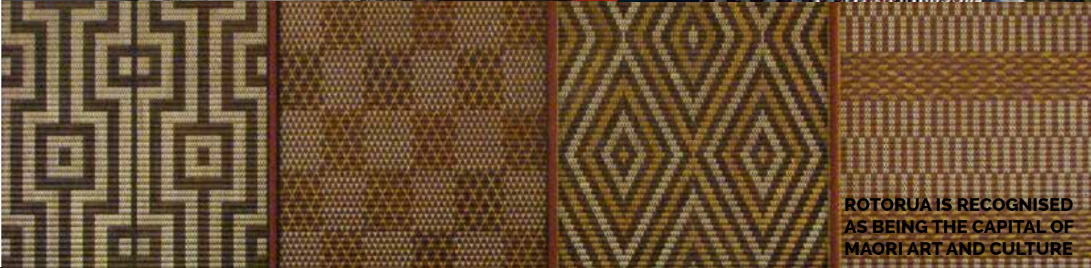
ROTORUA IS RECOGNISED AS BEING THE CAPITAL OF MAORI ART AND CULTURE