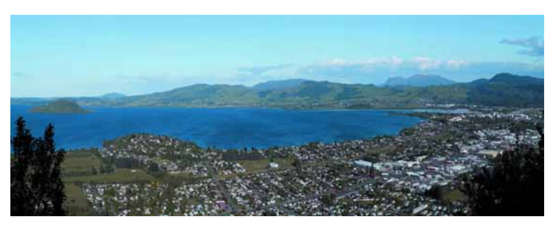
Plate 1 Lake Rotorua shown with Rotorua township on its margins

Lake Rotorua (Te Rotorua nui a kahumatamomoe, the basin like lake of Kahumatamomoe ) is the largest lake in the Bay of Plenty Region, and the most productive trout fishery in New Zealand.