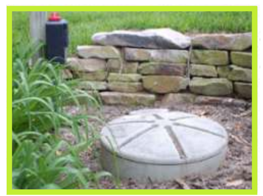
Figure 2: Access lids in property settings.

The system consists of a polyethylene or fibreglass chamber into which a single electric grinder pump is installed (Figure 1). The grinder pump has the function of grinding up any solids entering the pump, with a resulting liquid slurry being pumped through the pressure main which can be reduced to as small as 40mm. The chamber is 2m in height, all of which is buried underground except for the access lid. The access lid protrudes up to 100mm above ground level, is 700mm in diameter and green in colour. (figure 2)