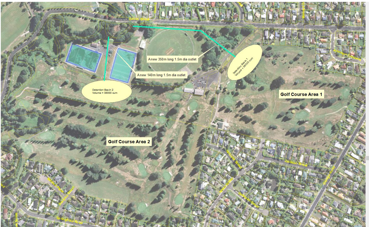
Figure 3. West 07 - Springfield Golf Course proposed works