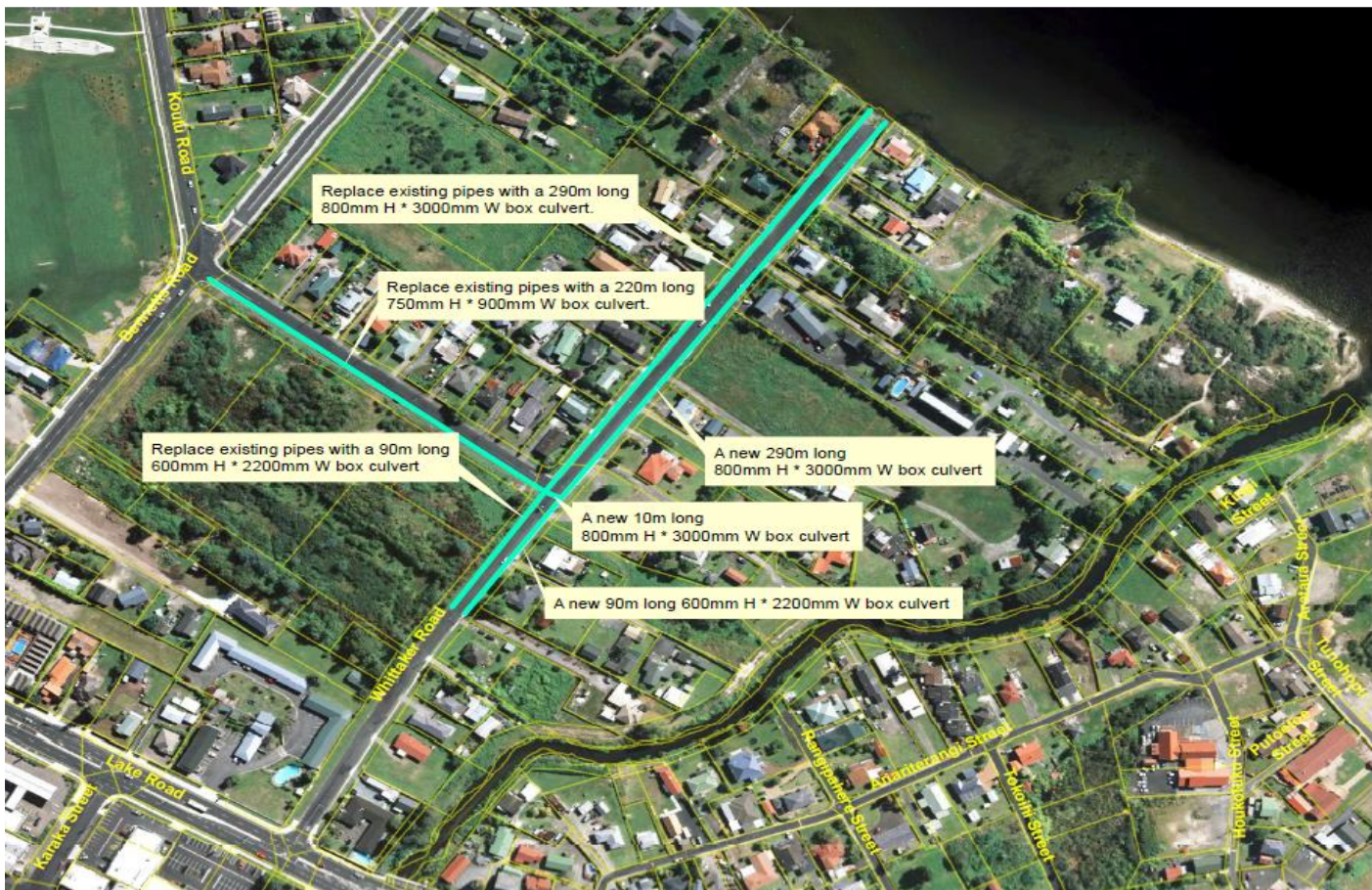
Figure 4. West 08 - East of Bennetts Road proposed works