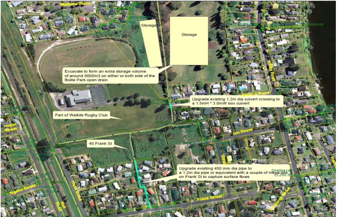
Figure 2. West 06 - Frank Street and part of Waikite Rugby Club proposed works