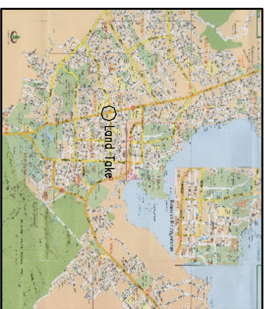
Rotorua Street Map Not to scale

NOTE: All boundaries and areas are approximate only and subject to survey.