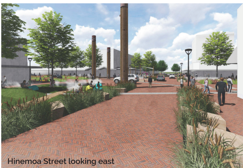
Hinemoa Street looking east

"I think it will create more passing traffic" Simon Strickland Fix coffee