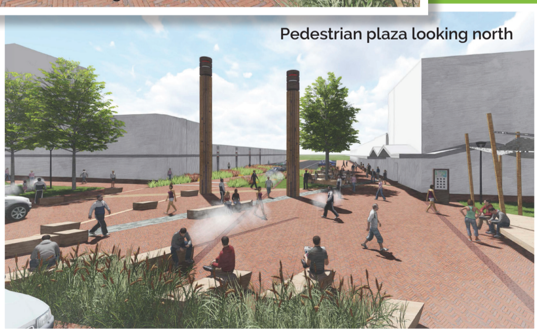
Pedestrian plaza looking north