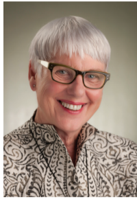
Mayor Steve Chadwick

In a two stage process the central inner city is being transformed into a fresh, modern place providing more open spaces for pedestrians, improving traffic flow and removing the visual barriers to sightlines along Tutanekai and Hinemoa streets.