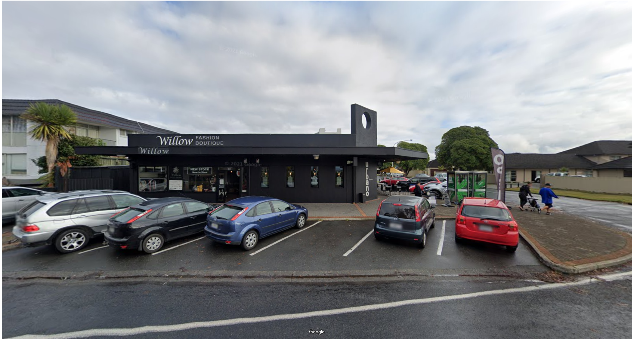
Rotorua, Bay of Plenty Google Street View - Jun 2020