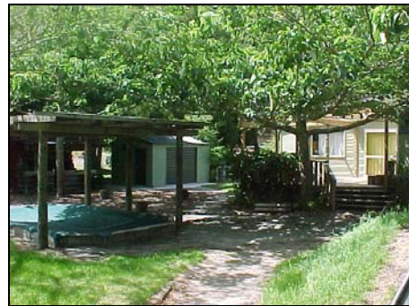
The area behind Lake Okareka Hall is well used by the local Pre-School Group

The reserve on which the Lake Okareka Hall is located was vested in the Rotorua District Council in 1980. The hall, and the land to the rear of it, are now used largely by the Lake Okareka Pre-School Education Group. Other users of the hall include community groups, sporting groups, and both local and non-local people for private functions. The hall has an important place in the community and is enjoyed and respected by those who use it.