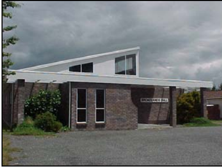
Broadlands Hall, December 2002

Broadlands Hall has received many alterations and improvements over the years, with much of the cost covered by Hall Society fundraising. In 1945 a ladies cloakroom was added and the kitchen was lined. In 1953 the hall was painted and a water tank and system installed, as well as a zip heater. The roof was also straightened and strengthened, and eight electric lights and two power points were installed. In 1954 a concrete septic tank was built to improve the toilet facilities. Other improvements have included the installation of a new dance floor, new seats, and painting of both the interior and exterior of the hall.