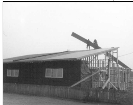
Construction of new hall, 1985