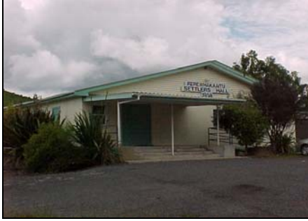
Rerehakaaitu Hall, December 2002

Shortly after its construction was complete, ownership of the Rerehakaaitu Settlers Hall was vested in the Rotorua County Council. Many alterations to the hall have been undertaken over the years, through the commitment and hard work of the hall committee and supporting members of the Rerehakaaitu community. Major alterations have included the building of a supper room and addition of the play-centre room (1975), and construction of the Andrew Fox meeting room with the assistance of a bequest from the estate of a past resident (1986). The local community is very proud of the current facility.