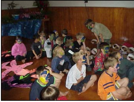
Students from Ngakuru School wait to perform at their 2002 end of year concert.

Various improvements have been made to the hall since its construction, including a supper room that was built in 1954. In 1965 the front area outside the hall was sealed. In the 1970s the front entrance was renovated and a new floor put in. Local volunteers assisted with the many different improvements. The Ngakuru Jubilee Committee (1983, p 58) recalls amusingly that "... a story arose about the willing helpers... there was one in particular who was putting a lot of effort into painting the new supper room – only to find that he had added paint stripper instead of paint thinners into the paint!"