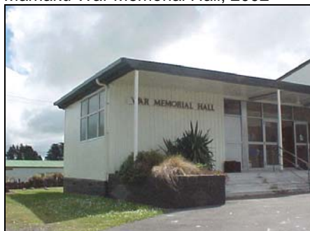
Mamaku War Memorial Hall, 2002

Voluntary assistance from the Mamaku community has been an integral part of establishing the hall and keeping it operational. In the 1970s the hall committee hired local builders to construct an extension to the facility, and many people from the community pitched in and helped. The committee raised money for the extension by holding cabarets, and also received a grant from the Ministry of Recreation and Sport. The Mamaku War Memorial Hall has hosted many events, occasions and gatherings over the years, and continues to be used for community activities and events.