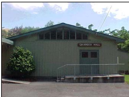
Lake Okareka Hall, 2003

Each of Rotorua's rural community halls has been central to the development of its respective community. This booklet records some of this rich history, collected from written and oral records. Although community involvement in the halls has waned over the years, they remain a vital part of their communities' social fabric. Contact details are included at the back of this booklet for each of the rural community halls administered by Rotorua District Council.