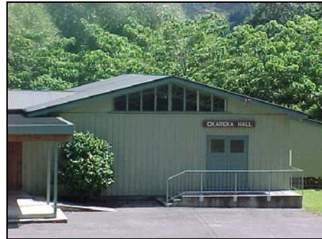
Lake Okareka Hall, January 2003

In 1955 members of the Lake Okareka community identified the need for a public hall, as local groups and organisations needed a suitable venue. A Hall Society was subsequently formed, along with a hall committee. Members of the committee focused on raising funds for the establishment of the hall, as well as providing entertainment for the young people of Lake Okareka, while the Hall Society sought other forms of funding as well as a suitable site. Fundraising activities included stalls, raffles and dances. Residents assisted the hall committee by supporting fundraising, donating money, and helping with the construction of the hall. The Rotorua County Council also provided assistance, by supplying building equipment and a foreman carpenter. Construction of the hall commenced in November 1958, and the facility was opened in 1959. The hall was then vested in the Rotorua County Council.