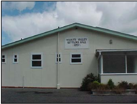
Waikite Hall, December 2002