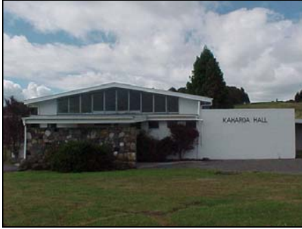
Kaharoa Hall, December 2002

Kaharoa Hall is greatly appreciated by those who have used it, and holds a distinctive place in the local community. Regular users of the Kaharoa Hall include sporting groups, community groups, and students and families from the adjacent Kaharoa School, which regularly uses the hall for its annual concert and other events. The Kaharoa Hall Committee organises various activities at the facility, including dances, games evenings, and Christmas parties. The hall is also used by the community for functions such as weddings, birthdays, dances, and indoor sports, as well as for public meetings.