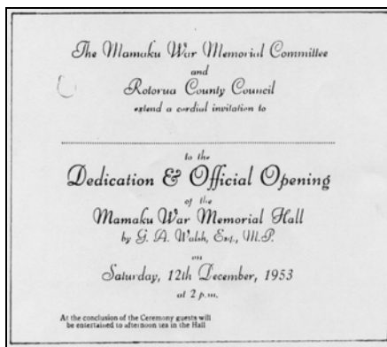
Invitation to Mamaku War Memorial Hall opening, 1953