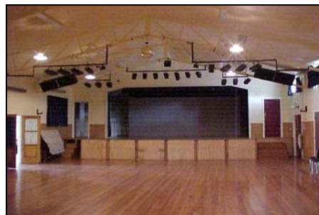
Inside Rerewhakaaitu Hall, 2002

In the 1950s, settlers in the Rerewhakaaitu area formed a public hall committee. Under the supervision of a Rotorua County Council building inspector, the committee built a hall that would prove to be the focal point of the Rerewhakaaitu community. The settlers received a Government subsidy of £500 and then raised £4000 themselves through donations of hay, boner cows and calves, and other initiatives. A mob of sheep was purchased, raised by local farmers, and re-sold. Two seasons' crop of lambs and wool were also sold, with all proceeds going to the hall. Other fundraising events included housie nights and card evenings. In this way, the hall was debt-free for its opening day. Much of the success in terms of construction and fundraising was thanks to the sharing of information from the Waikite Valley Hall Committee, which had recently opened its own hall.