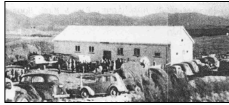
Opening of Ngakuru Hall, 1945

In 1943 a public meeting was held to discuss the building of a hall for the Ngakuru area. At that meeting a working committee was formed to plan the construction and to begin fundraising. Purchasing materials during wartime proved to be an enormous task, but construction finally began on 8 January 1945. Volunteers from the Ngakuru community and the newly formed Hall Society carried out all the planning and work. "Farmers came along and helped, as time permitted from their own work, bringing along any other available labour who could wield a hammer or use a saw or paint brush" (Ngakuru Jubilee Committee, 1983, p 58).