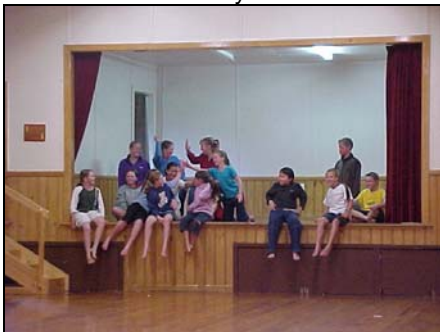
Waikite Valley School students practice for their 2002 end of year concert

The hall has been utilised by a range of people since it was opened, and has proven to be a valuable asset to the community. It is of particular importance to Waikite School, which makes use of the hall on a regular basis for student assemblies, indoor sports, and the students' end of year concert. Other members of the community use the hall for activities such as table tennis, indoor bowls, and badminton. People have also gathered at the hall to celebrate weddings, anniversaries, birthdays and other events.