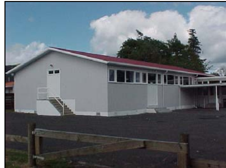
Ngongotaha Hall, December 2002

The building of a new hall was enabled by the assistance of members of the community and various organisations. The Ngongotaha Community Hall was opened on 12 December 1970, and has subsequently been well used by a wide range of people from Ngongotaha and surrounding communities. Regular users include local service organisations, sport and recreation clubs, and the internationally renowned Ngati Rangiwewehi Maori cultural group.