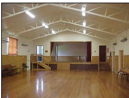
Waikite Valley Settlers Hall, 2002

Local volunteers largely drove the planning and construction of Rotorua's nine rural halls, with assistance from community fundraising and donations. Today, the management and maintenance of the halls still relies on the energy of volunteers, with funding and assistance from the District Council and other sources.