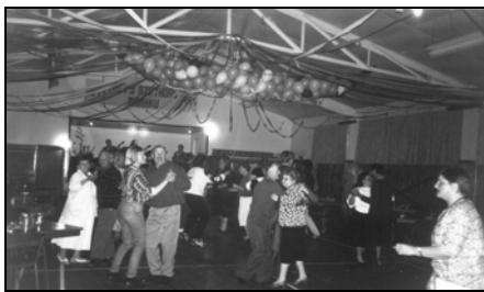
Mamaku Centennial Dance, 1994

Rural community halls are a focal point for social events, sports, and other activities. From generation to generation, they have provided a place for the community to gather, celebrate, commiserate, watch movies, socialise, dance, play games, compete, and debate issues.