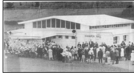
Newly rebuilt Kaharoa Hall, 1971

In April 1923, a group of settlers formed the Kaharoa Public Hall Society Incorporated for the purpose of developing a community hall. Many local residents volunteered to assist with construction, and the Kaharoa Hall was subsequently opened in June 1925. The Society owned and managed the hall, and endeavoured to keep it operational at all times. However, exception was made during the Depression era of the 1930s, when resources were rationed and money was scarce. The Society was effectively inactive from 1934 to 1943, although it still managed to raise funds to pay rates.