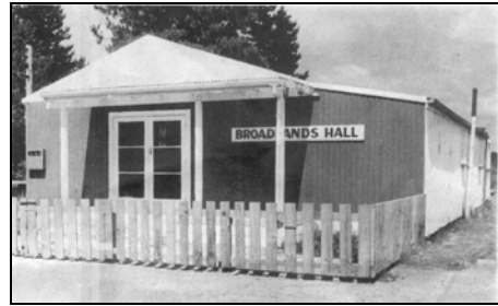
Former Broadlands Hall, date unknown