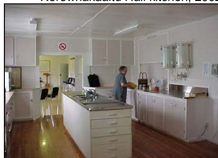
Rerewhakaaitu Hall kitchen, 2002