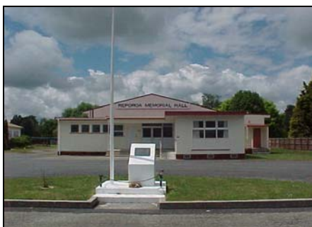
Reporoa Memorial Hall, 2002

Rural community halls are a focal point for social events, sports, and other activities. From generation to generation, they have provided a place for the community to gather, celebrate, commiserate, watch movies, socialise, dance, play games, compete, and debate issues.