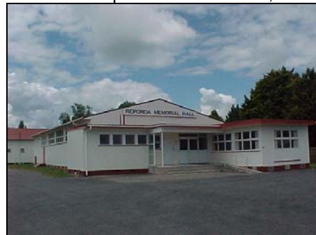
Reporoa Memorial Hall, 2002

The hall has been used in recent years by a wide range of people and organisations from the Reporoa community and surrounding area. A variety of alterations have been made, including electric heaters and wheelchair access. The Reporoa Memorial Hall continues to be much appreciated by those who use it.