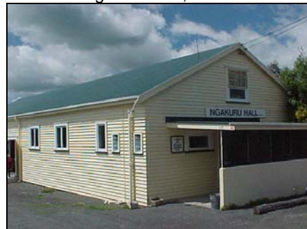
Ngakuru Hall, December 2002

For many years after its opening the Hall Society hosted a successful annual ball, with all proceeds going toward the operational costs of the hall. There were many other fundraising events run by the Hall Society and other community members in support of the hall. Community effort, participation and support have assisted in keeping the hall operational.