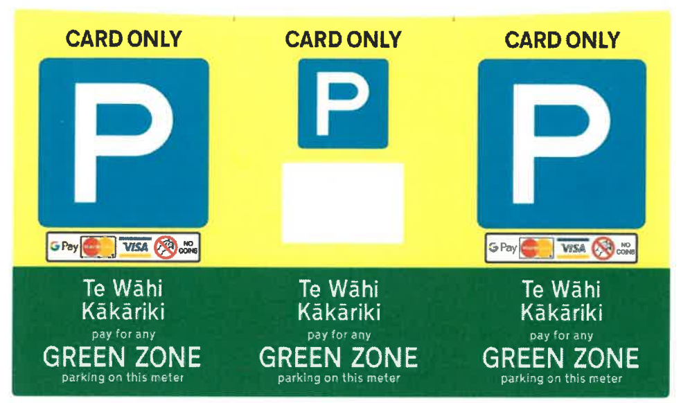
Green Zone, Card only meter sign

Specific guidance to the nearest available meter is provided by the meter helpline. In addition, usually the meter fault screen will advise the user to use another meter in the relevant Zone which are clearly indicated on the meters.