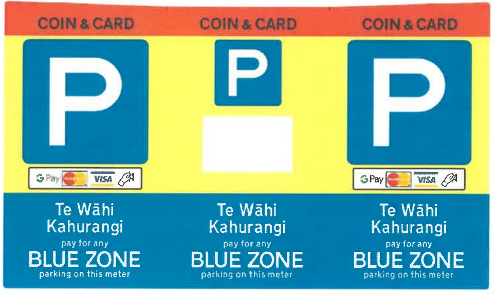
Blue Zone, Coin and Card capable meter

If meter is not working please call 09 444 2971 and quote Meter ID 1234