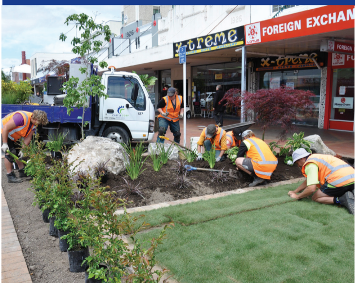
Council staff planting one of four Tutanekai/Pukuatua street intersections.

Rotorua District Council gardens staff have reconfigured and replanted the four corners of the Pukuatua/Tutanekai street intersections, including laying areas of ready-lawn.