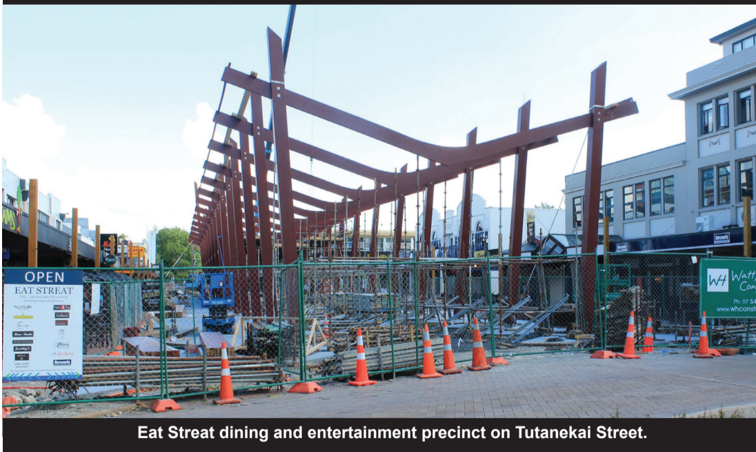
Eat Street dining and entertainment precinct on Tutanekai Street.

Construction of Eat Street, Rotorua's specialist dining and entertainment precinct, is progressing well with most of the timber portal structure now in place, highlighting the large scale of the central covered structure.