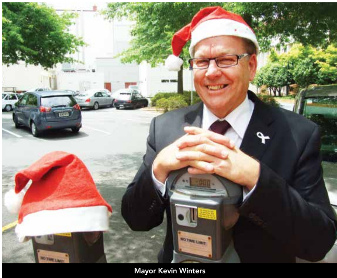
Mayor Kevin Winters