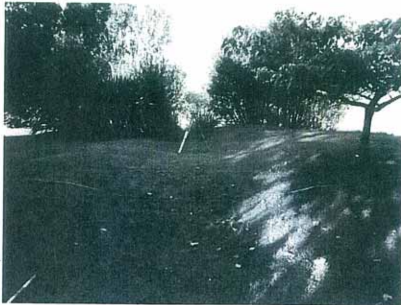
PHOTOGRAPH 2: CATCHMENTS O2+O3 - Outlet of the wash (DP2)