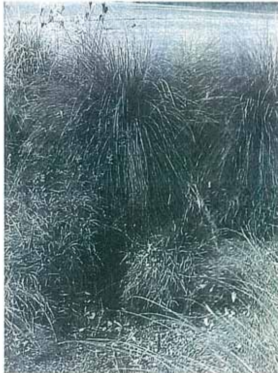
PHOTOGRAPH 5: CATCHMENT O6 – Outlet Summit Road (DP6)