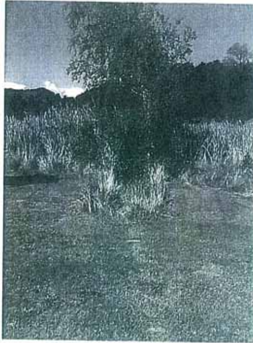
PHOTOGRAPH 7: CATCHMENT O8 – Outlet Ben Road (DP8)