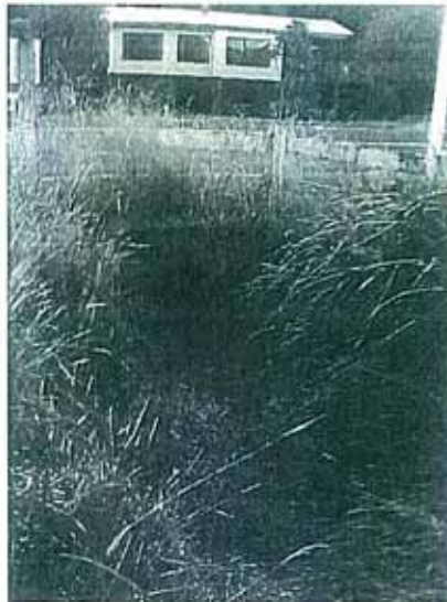
PHOTOGRAPH 6: CATCHMENT O7– DP7