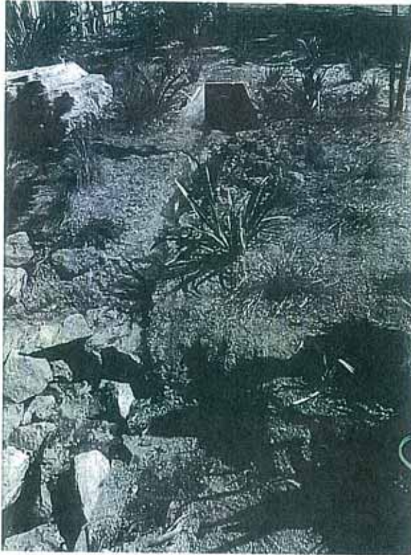
PHOTOGRAPH 1: CATCHMENT O1 - Outlet Steep Street (DP1)