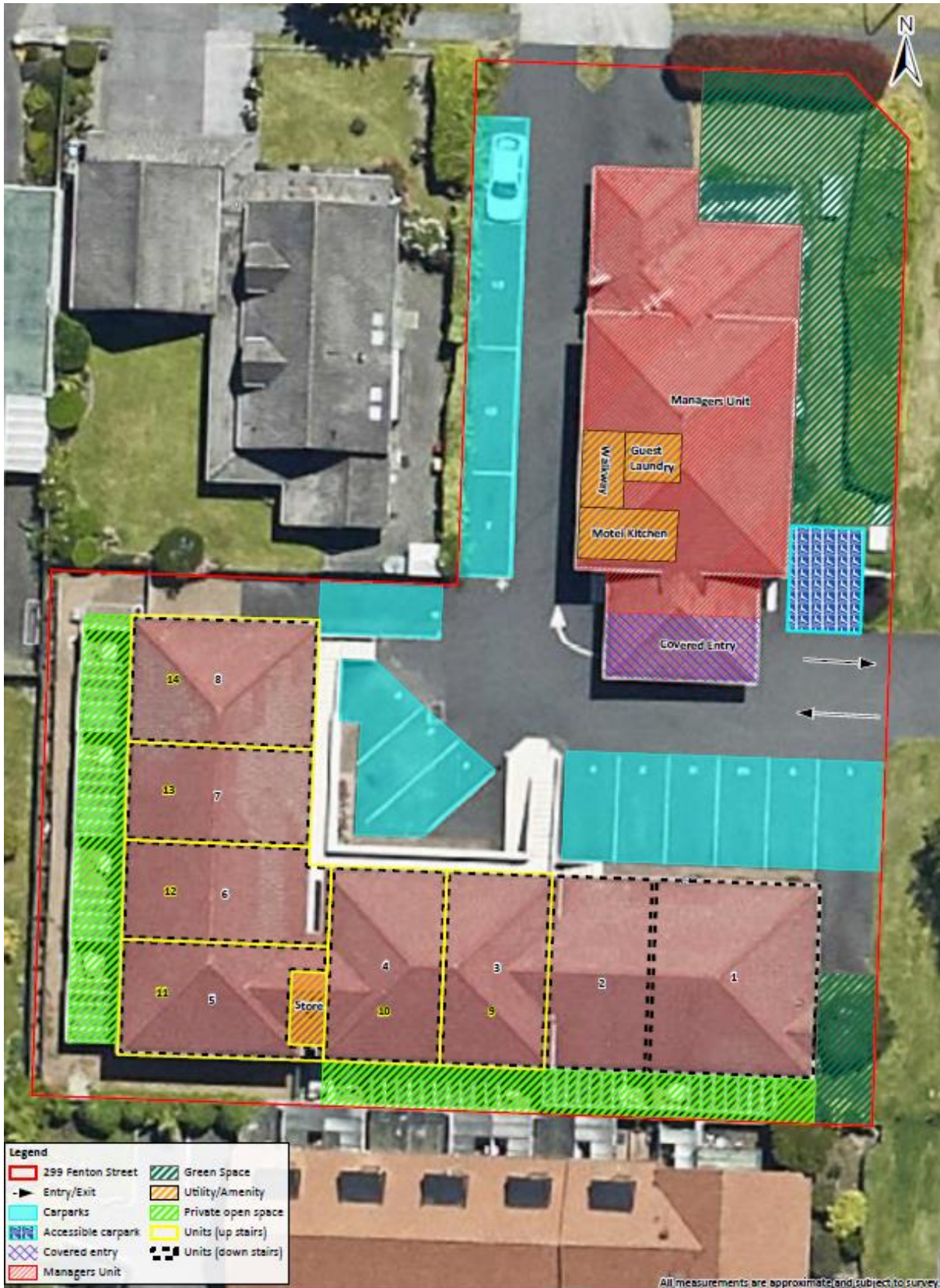
Figure 3 – Site plan showing number of units, carparking, managers unit/office and children’s play area.