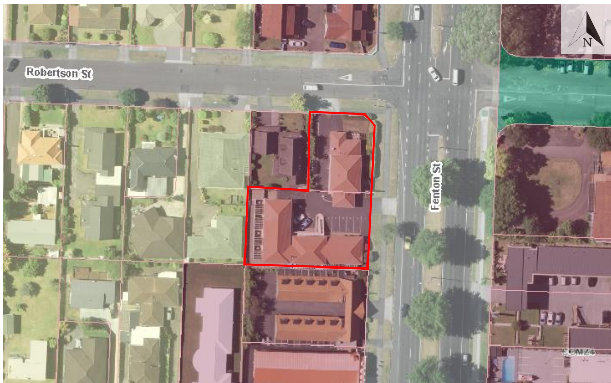
Figure 1 – District Plan zones with the subject site outlined in red. The yellow is Residential 2 (RESZ2), the purple is COMZ4 and the green is Community Assets (CAZ).