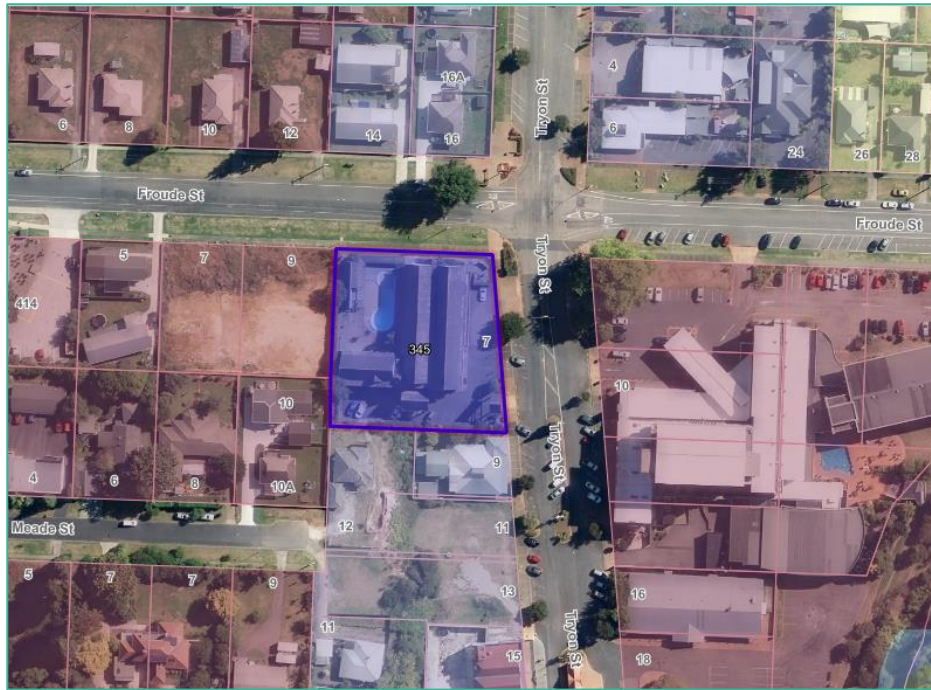
FIGURE 3: AERIAL IMAGE OF SUBJECT SITE SHOWING DISTRICT ZONING OVERLAY