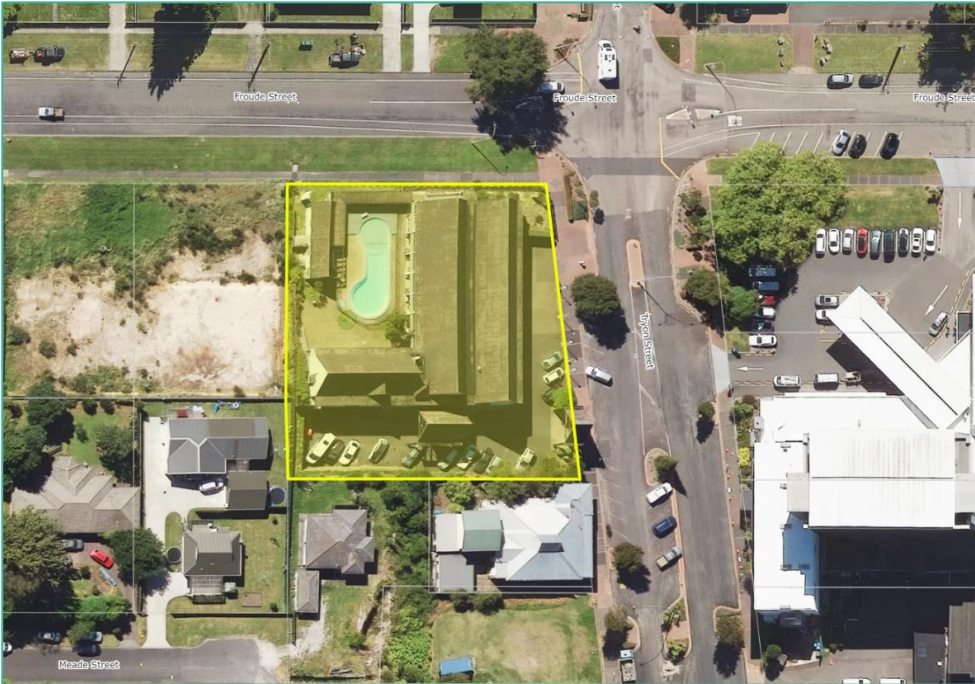
FIGURE 1: AERIAL IMAGE OF THE SITE

The 2,864m 2 site has frontage to Froude Street along its northern boundary and Tryon Street to its eastern boundary (see Figure 1 below). There have been no changes to the subject site which make it materially different from the existing environment described in the previous application.