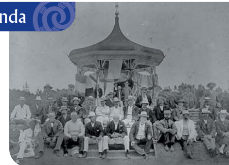
Band Rotunda - Rotorua Museum

It features cast-iron filigree work, a Victorian break-through that became widely used for constructing garden buildings and furniture. VIPs who came to town used the rotunda to deliver speeches: Prime Minister Richard Seddon once spoke here for an hour and a half!