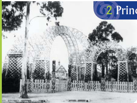
Prince's Gate Arches and Gateway prior to restoration - Rotorua Museum

The carvings located at the Hinemoa and Arawa Street entrances to Government Gardens were presented by the people of Ngati Whakaue to commemorate their original gift of the land in 1880 "hei oranga mo nga iwi katoa a te ao – for the benefit of the people of the world". Created by master carver Tene Waitere, they depict tribal ancestors.