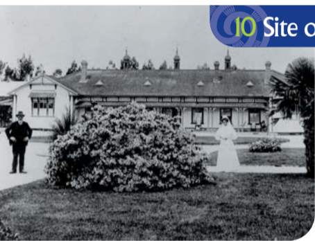
The Sanatorium - Rotorua Museum