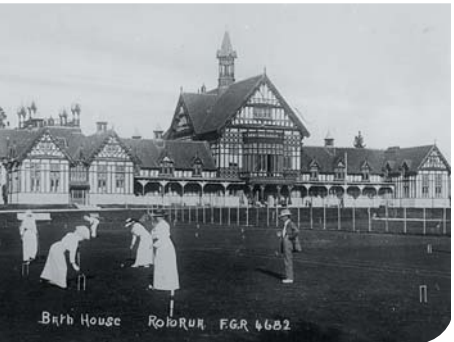
BHFB House ROTORUA FGR 6682

In 1998 the 1950s terracotta roof was replaced with a new pagoda style roof. The gardens have hosted a variety of sports including tennis, bowls and croquet and, more recently, petanque.