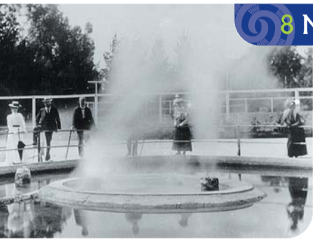
Malfroy Geysers