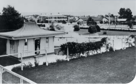
Croquet Pavilion - Rotorua Museum

Built in 1907, the original pagoda-roofed 'tennis' pavilion was sited near the Malfroy Geyers. The pavilion was moved to its present site during the 1920s and extended over the years.