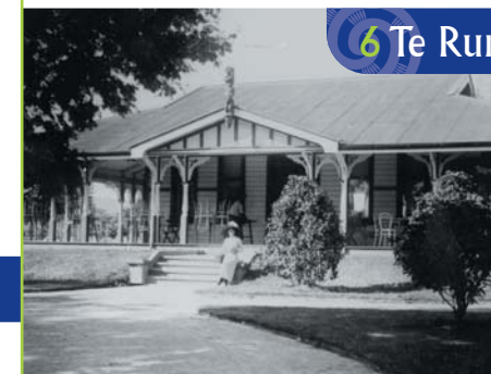
Te Runanga Tea House - Rotorua Museum

Te Runanga (the Meeting House) was built in 1903 as a tea pavilion and for many years served as a social centre for Rotorua. Here tourists and invalids could lounge, read and drink tea or mineral waters.