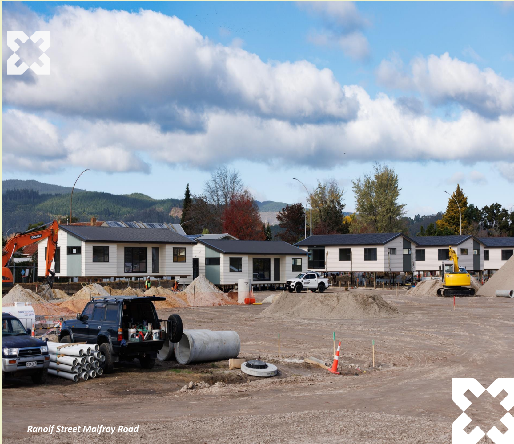
Ranolf Street Malfroy Road