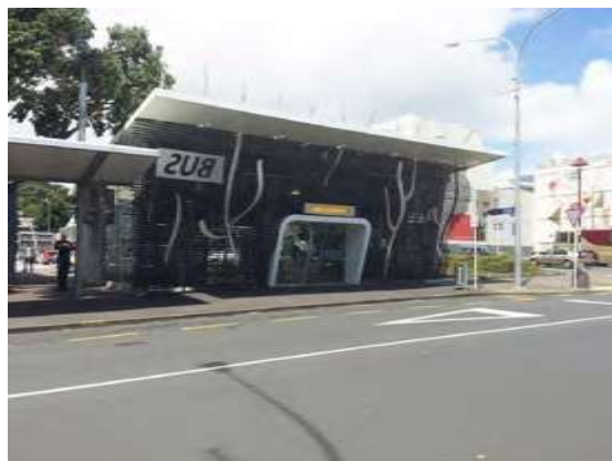
Bus stop in New Plymouth