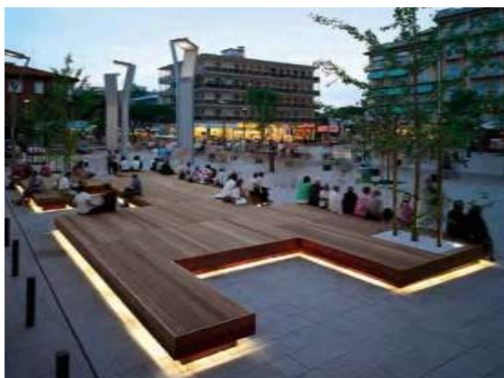
Public space in Italy