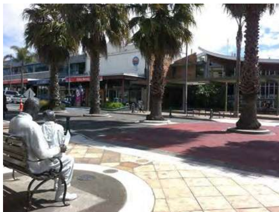
Library hub in Gisborne