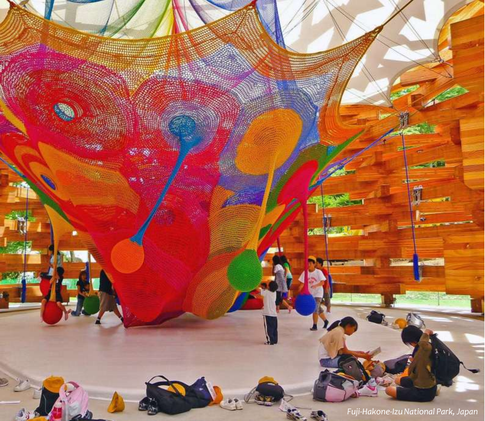
Fuji-Hakone-Izu National Park, Japan