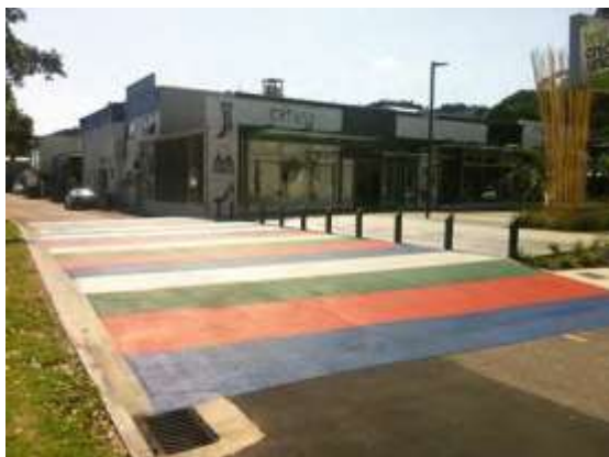
Crossing linking car parking to public space in Whakatane