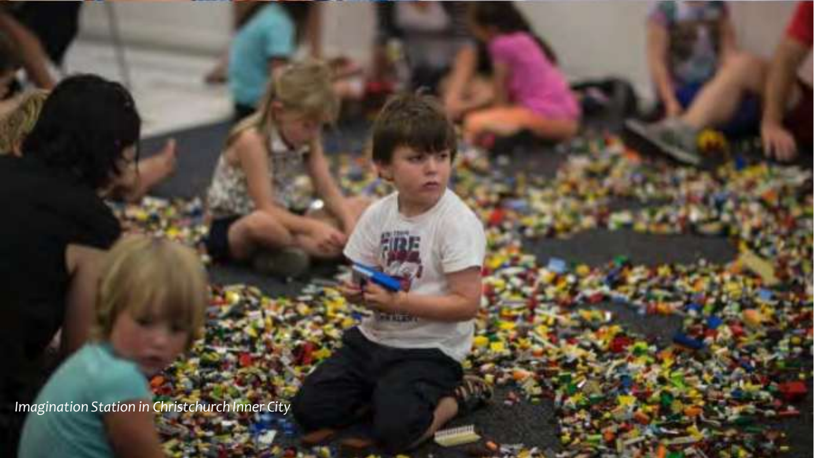
Imagination Station in Christchurch Inner City