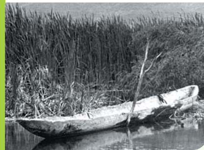
Canoe moored amongst the raupo, c. 1900

Maori found the area useful as a place to moor canoes and named the area Kouramawhitiwhiti. Today much of the land you walk on has been reclaimed from the lake. The row of large Plane trees ( Platanus orientalis ) behind the playground marks the original lake edge. These trees are over one hundred years old.